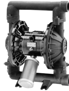
Husky 1590 Aluminum DB3XXX or DC3XXX