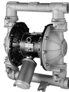
Husky 1590 Stainless Steel DB4XXX or DC4XXX