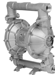
Husky 1590 Stainless Steel DT4XXX or DU4XXX